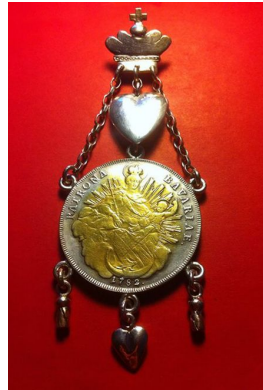
Fig. 6. Dukach with hearts. Made on the basis of the thaler of 1782 “Patrona-Bavariae”. The reconstruction of the “Research Centre for the Revival of Volyn”, the town of Radyvyliv, Rivne region. Silver, gilding.