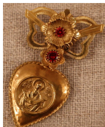
Fig. 21. Vasyl Bilonozko. Yahnusok with a bow.