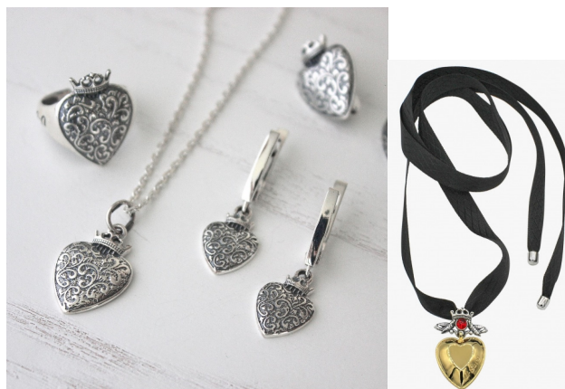
Fig. 14. Atelier Skifska-Etnika. Bila Tserkva. A set of pendant-yahnusok, earrings on a schwenge, a ring. Silver, blackening. Silver, gilding.