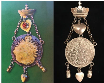
Fig. 7. Dukach of the 19th century from the collection of Bila Tserkva Museum of Local History. Medallion ‘Patrona Bavaria’, silver, gilding. The reconstruction of this 19th century dukach was made by Yuriy Kovalenko. Medallion – copy of the “Bavaria Patronus”, silver. “Bow” dukach-silver.