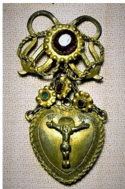
Fig. 4. Lychman-Yahnusok (Lychman-Yahnusok). The last third of the 18th century. Silver with gilding, inserts - amethyst and glass panes. Collection of Chernihiv Historical Museum of V. V. Tarnavskiyi.