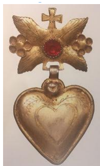
Fig. 10. Yahnusok with the symbolic Bethlehem star and the Cross, Chernihiv Region, end of the 19th century. From the book by I. Spassky.