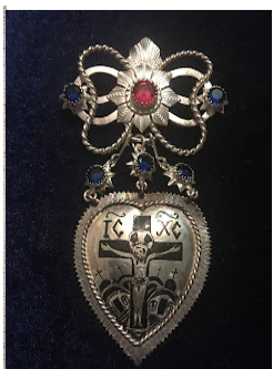
Fig. 5. Reconstruction of yahnusyk from Voronezh region of the end of the 19th and the beginning of the 20th centuries.