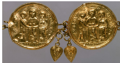
Fig. 1. Fragment of Byzantine marriage belt of the VI-VIIIth centuries with connected free-hanging hearts. Coll. Dumbarton Oaks, Washington (USA).