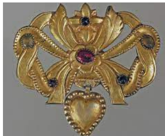
Fig. 8. Yahnusok, the end of the 18th – the beginning of the 19th centuries. Originates from Poltava Oblast. Collection of the NMIU Treasury. Silver, gilding.