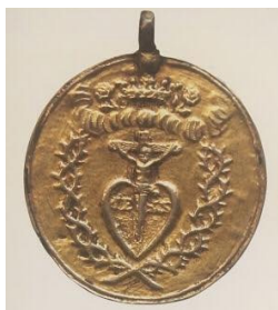
Fig. 3. Dukach with a heart motif, a repetition of the Western European original of the 17th century. From the collection of Yuriy and Yaroslava Kovalenko.