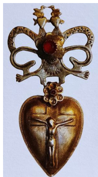
Fig. 17. Yahnusok from Slobozhanshchyna with Crucifixion, bow, birds, glass inserts. Reconstruction of Yu. Kovalenko. Silver with gilding. 2020s