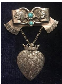
Fig. 11. Wedding dukach-yahnusok with a symbolic towel, paired rings, wedding crown, pressed turquoise. Kyiv, the end of the 19th – beginning of the 20th century. Reconstruction based on the two-stool original at Volodymyr Lyulin NMI.