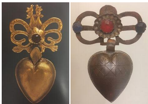
Fig. 9. Yahnusky with a symbolic bow and birds, Slobozhanshchyna, the end of the 19th century. From the collection of Yuriy and Yaroslava Kovalenko. Photo from the site: http://ukrdec.blogspot.com/2017/11/blog-post_29.html