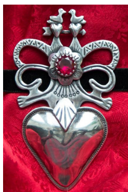
Fig. 13. Paslavsky Oleksandr (Zvenyhorodka). Yahnusok Silver, cubic zirconia. 2018.