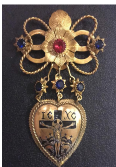
Fig. 16. Voronezh dukach with a heart, a bow, decorated with glass inserts. The reconstruction. Silver with gilding. 2020s.