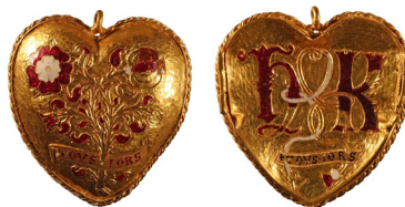
Fig. 2. A heart-shaped gold pendant from Tudor England (the Renaissance era) with the initials of King Henry VIII and his wife Catherine of Aragon, decorated with symbolic floral and font patterns.