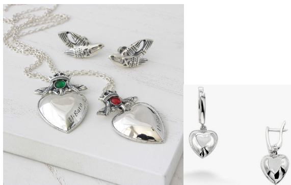
Fig. 15. Atelier Skifska-Etnika. Bila Tserkva. Yahnusok of the series “u. baro” (the Ukrainian Baroque). Silver, gilding. 2018 – 2020